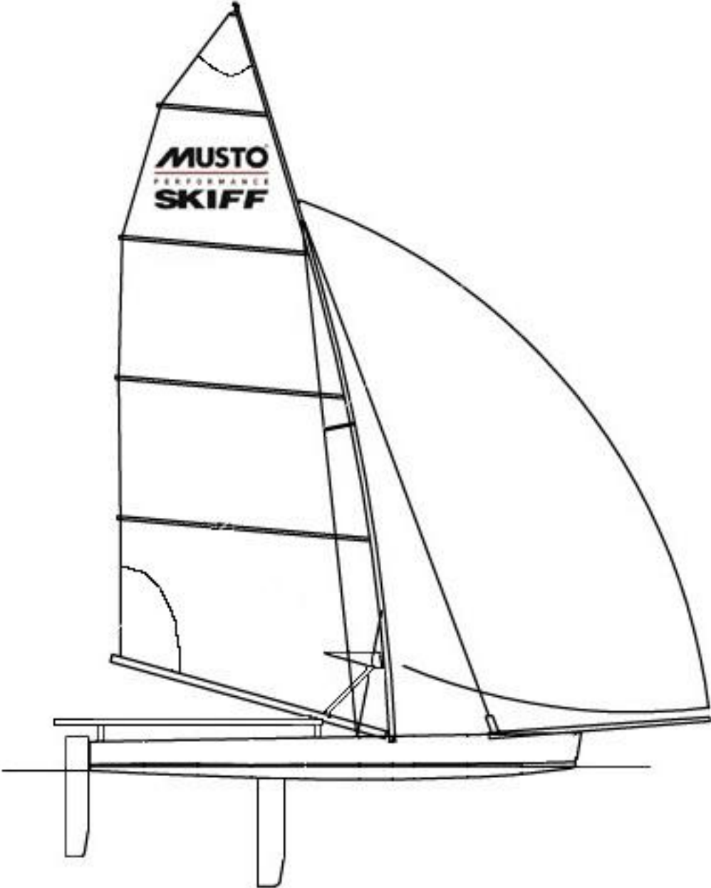
Figure 2.1 : Profile